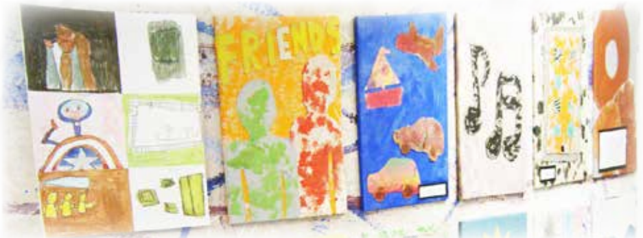
Artwork by Derbyshire schoolchildren

AJM Healthcare is currently working with different groups and schools to create community projects. This provides an alternative route of expression and helps us to connect with the community.